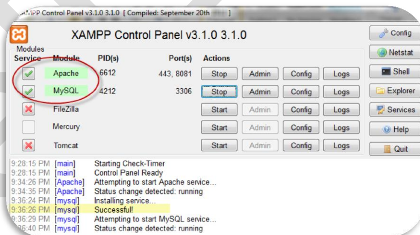
FIGURE 1 - XAMPP CONTROL PANEL

Your ports may vary from the screenshot below: