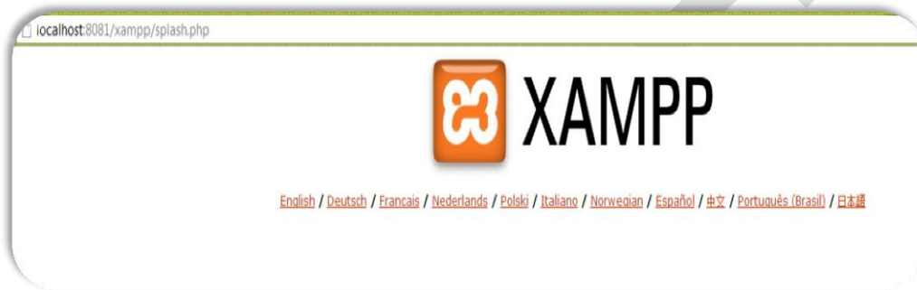
FIGURE 2 - XAMPP SPLASH PAGE