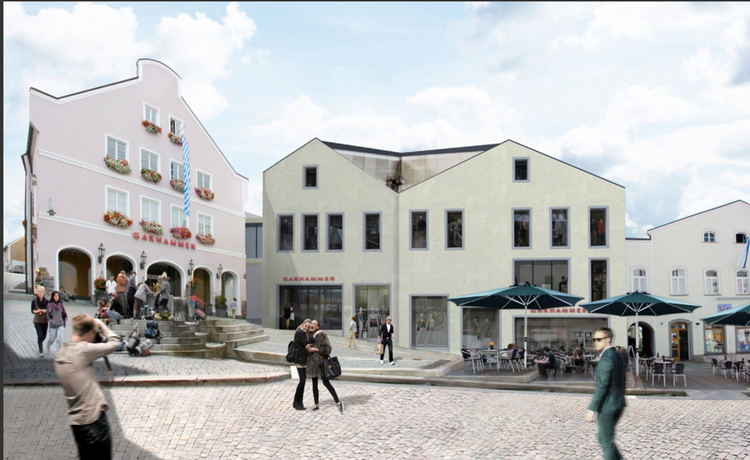
BLOCHER BLOCHER PARTNERS, Stuttgart. Garhammer comercial building. Project, 2011.