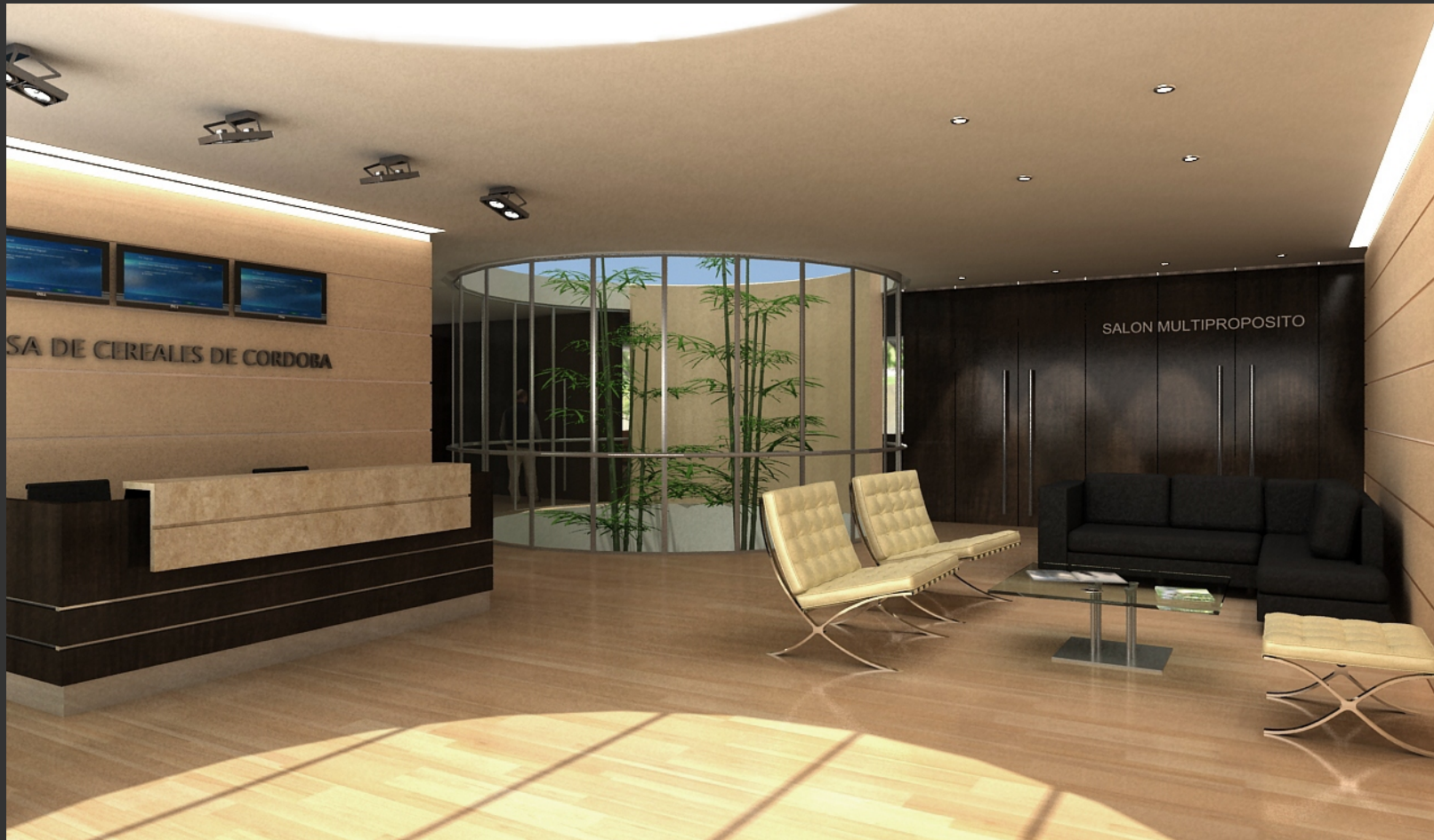
Luciani & Associates, Argentine. Córdoba Granes Agency Office. Competition, 2009.