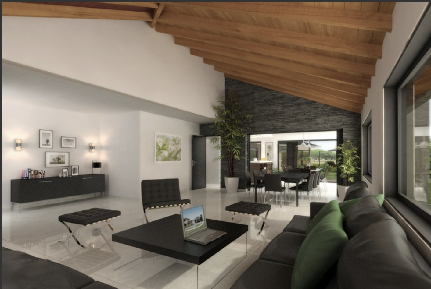
PROARQ group, Argentine. Family Housing. Project, 2011.