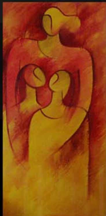
oil on canvas 120 cm x 60 cm