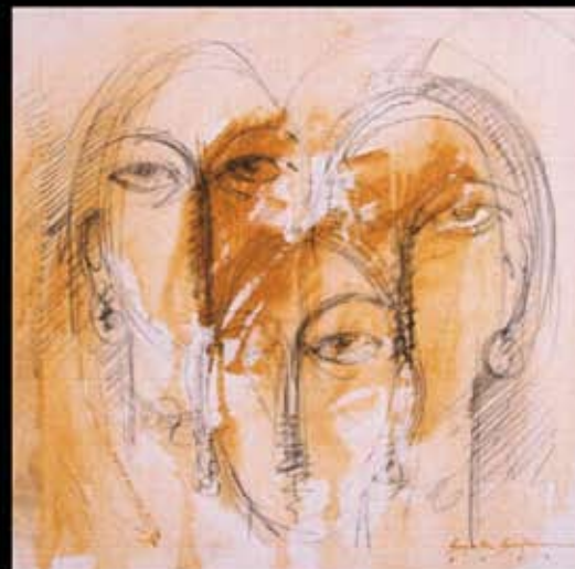
acrylic on canvas 45 cm x 45cm