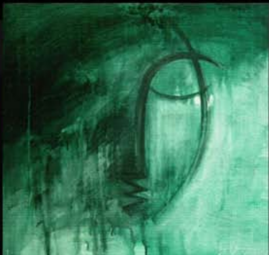
acrylic on canvas 45 cm x 45cm