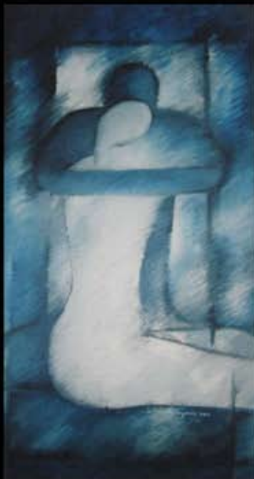
oil on canvas 105 cm x 45cm