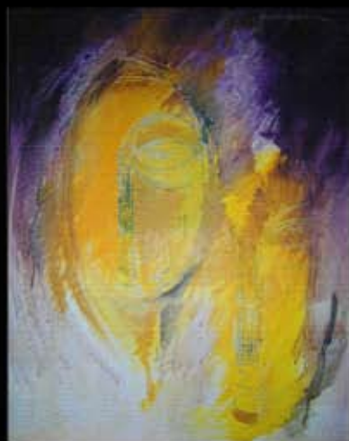
acrylic on canvas 45 cm x 45cm