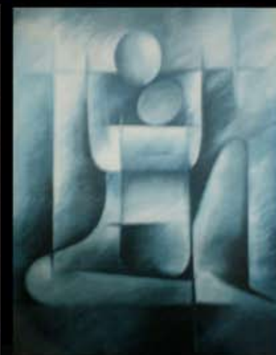
oil on canvas 90 cm x 75 cm